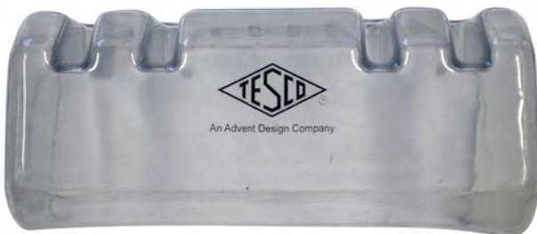
TEST SWITCH PROTECTOR CATALOG NO. 6441