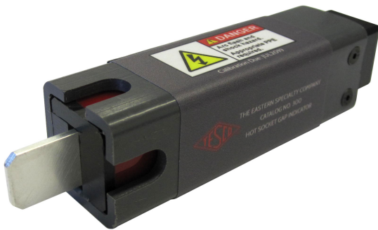
HOT SOCKET GAP INDICATOR WIDE BLADE CATALOG NO. 300

The TESCO Hot Socket Gap Indicator is used to determine if a meter socket jaw has become worn-out and unsafe for continued use. The Gap Indicator determines unsafe holding force on meter socket jaws based on laboratory testing.