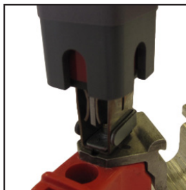
Red indication of a "bad" socket gap/loss of spring force.