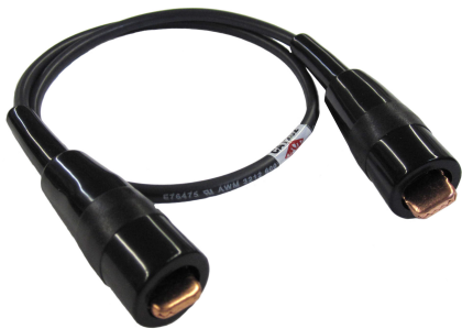
A-BASE JUMPER CATALOG NO. 202

TESCO A-Base Jumpers allow meter technicians to jump either customer-load or test-load on A-Base meter installations. TESCO A-Base Jumpers are equipped with alligator-clip connectors, and are available in either 10 gauge wire, which is rated for 30 amps or 8 gauge wire, which is rated for 75 amps.