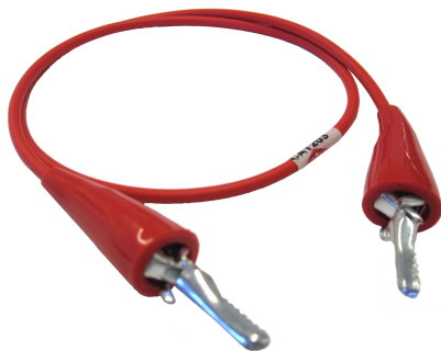
POTENTIAL JUMPER CATALOG NO. 203